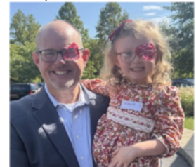
“Sometimes we just need someone who knows what it is like to go through what you’re going through.”

BEGIN EVERY DAY prayers and thoughts about the question: “Who is your ONE?”